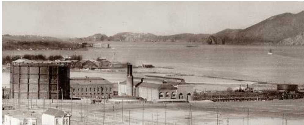
1880's/1890's until April 1906